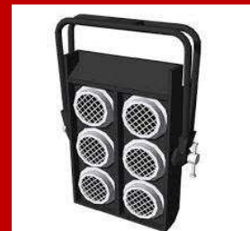
Audience Concert Blinders: 6 Light

Source 4 7.5 inch 10 inch Plates Offered